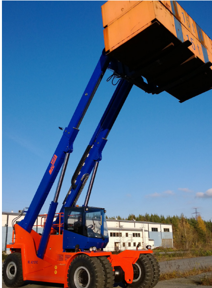
LIFTING CAPACITY DIAGRAM ML4212RC